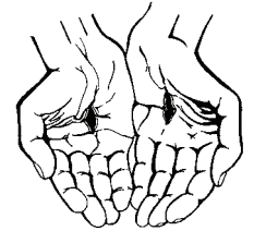
“Do not doubt but believe.” In 20:27

Zacchaeus was a tax collector known for extorting money. Yet when he heard Jesus would be coming by, he was determined to see him (Luke 19:1-10). He was not deterred by his short stature but climbed a tree to get a good view. Jesus called to him, and the two shared a meal together. Divine mercy transforms lives.